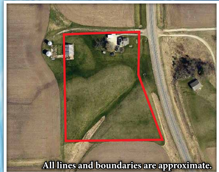
All lines and boundaries are approximate.

View website for more pictures & sale order!